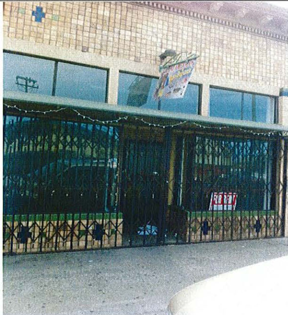
4715 International Blvd West side of International Bl @ 46 th Ave