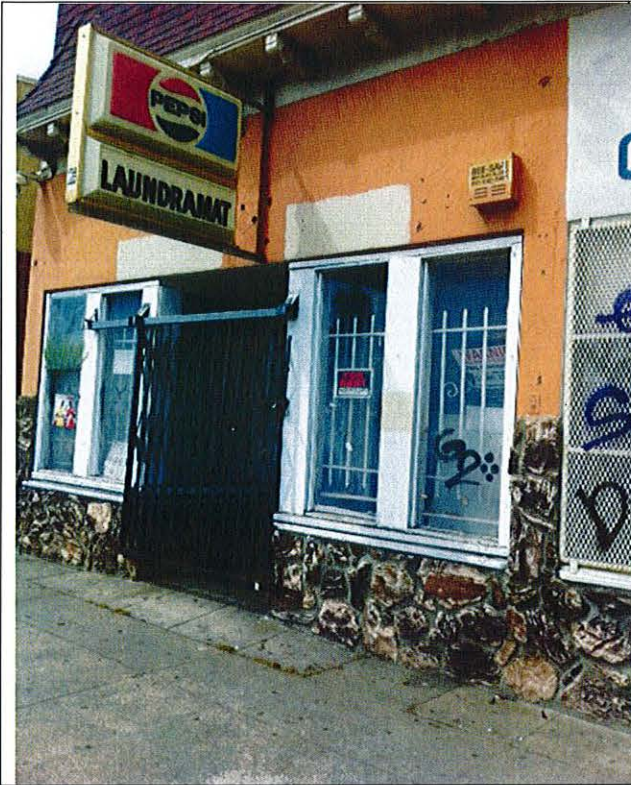
6928 International Blvd. East side of International Bl @ 68 th Ave