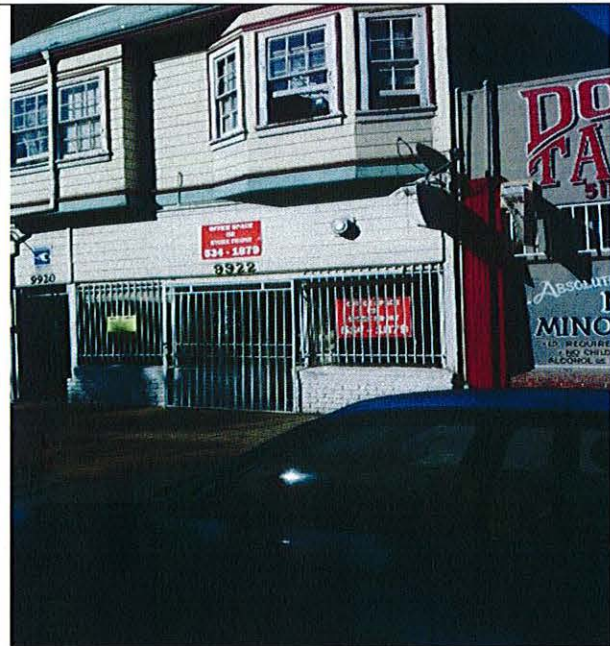
9922 International Blvd East side of International Bl @ 99 th Ave