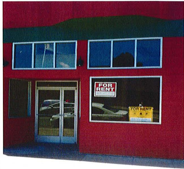
4537 International Blvd. West side of International Bl @ 46 th Avenue