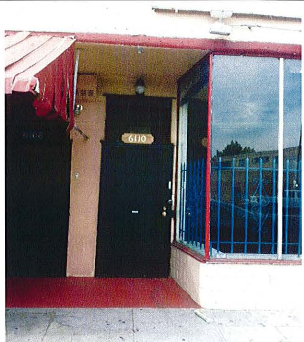
6110 International Blvd East side of International Bl @ 61 st Ave