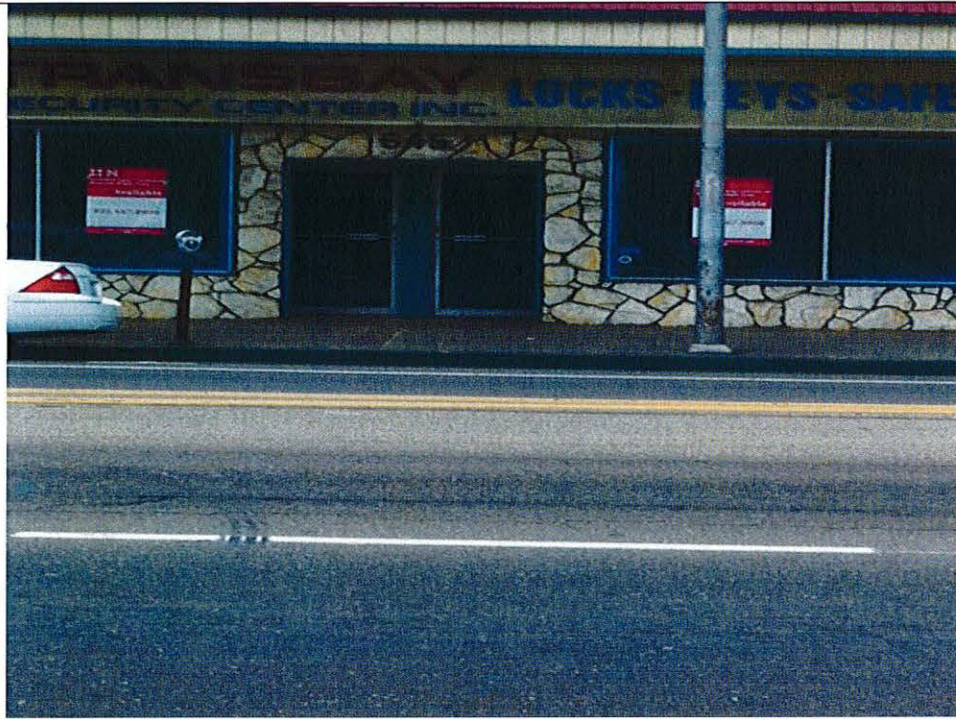
640 East 14 th San Leandro West side of East 14 th @ California