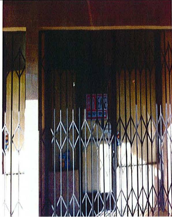
3322 International Blvd. East side of International Bl @ 33 rd Avenue