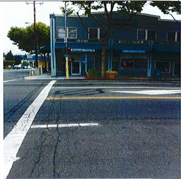
600 E. 14 th San Leandro East side of East 14th @ Best