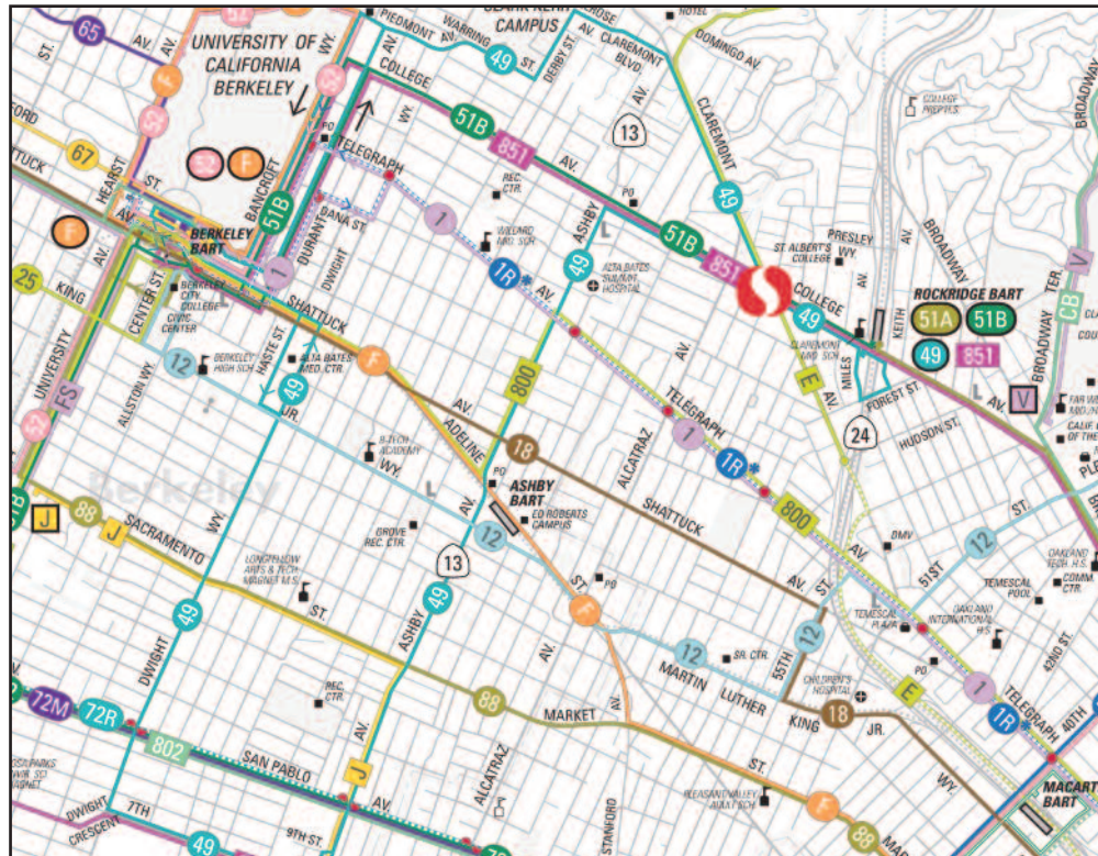
Marketing • May 2015