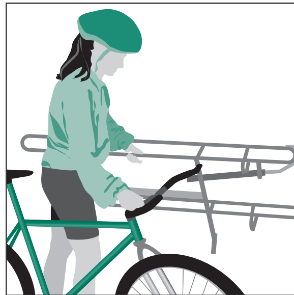
Lowering the bike rack.