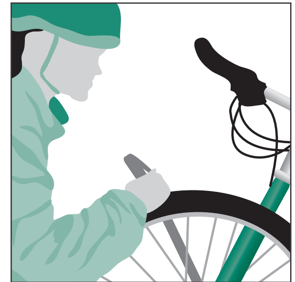
Securing the support arm.