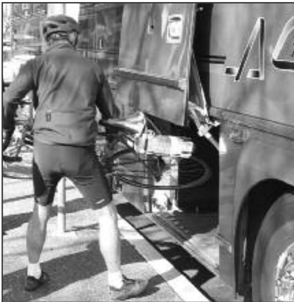
Loading a bicycle in an MCI cargo bay

* On a limited number of MCIs, custom-made racks are installed in the cargo bays. Each rack accommodates two bicycles, one above and one below a protective divider. To load your bike, follow the instructions on the rack.