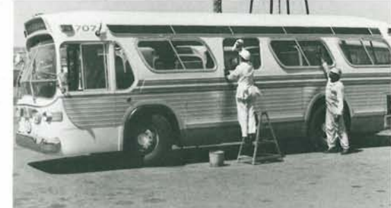
FINISHING TOUCHES —Maintenance workers wash down one of 13 Dial-A-Ride buses being converted from 35 to 29 feet in length for maximum maneuverability. Door-to-door bus service commences July 15 in Richmond.

Coming from Sweden, by way of the Pacific Northwest, is a 59-foot long bus built by Volvo for Stockholm's local transit network. It is scheduled to arrive in the Bay Area in August for a two-week testing period. The bus seats 74 passengers.